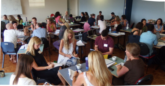
AIAS 2014 Intake: another impressive group.