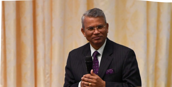
India High Commissioner, The Honourable Dr Gondane addresses AIAS students