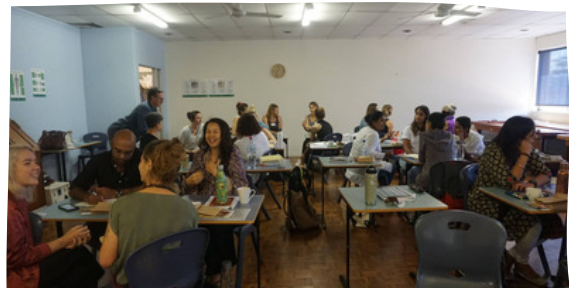
AIAS 2019 Ayurveda Diploma HLT52615 Intake