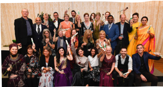
A.I.A.S Ayurveda Graduates 2014 Intake.