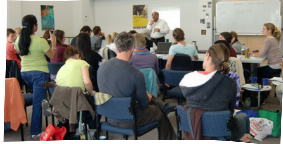
The 2011 AIAS Ayurveda Intake